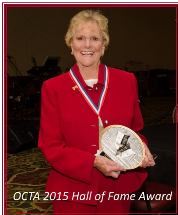
OCTA 2015 Hall of Fame Award